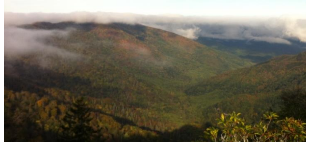
View of the Smoky Mountains from atop the Chimney Tops Trail in Great Smoky Mountains National Park